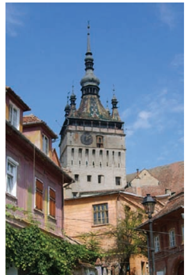
Clock-tower in Sighişoara