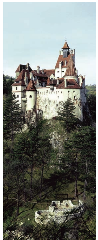
The 'Dracula' Castle in Bran