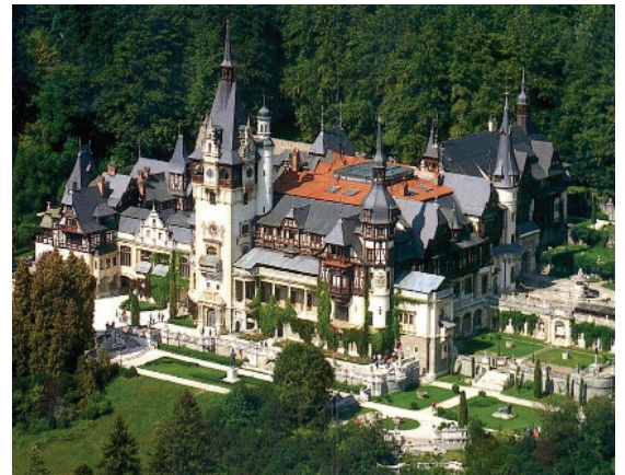
The Peleş Castle in Sinaia