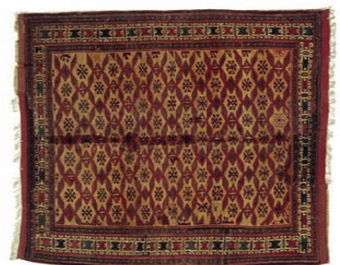
Star-lattice rug, late 15th century, in Sighişoara