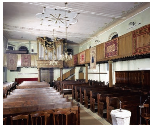
The Hungarian Lutheran Church in Braşov