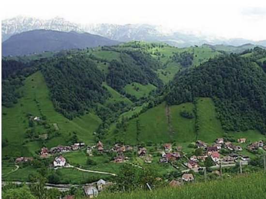
Moeciu seen from the Rucăr Pass