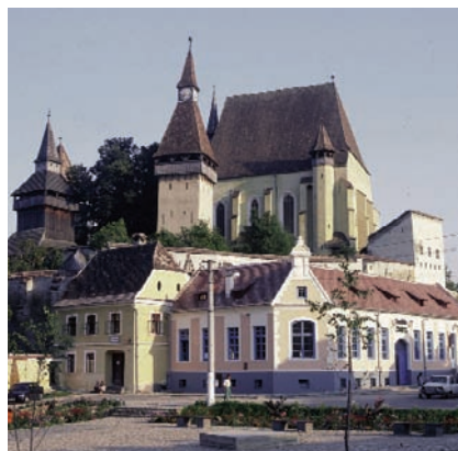
The Lutheran Church in Biertan