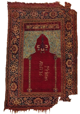
Kula prayer rug - formerly in the Lutheran Church of Rosenau