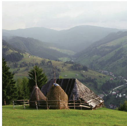
Landscape in the Carpathians