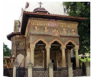
Stavropoleos Greek-Orthodox Church