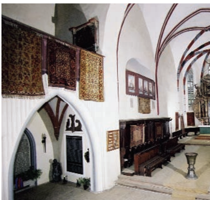
The Monastery Church in Sighişoara