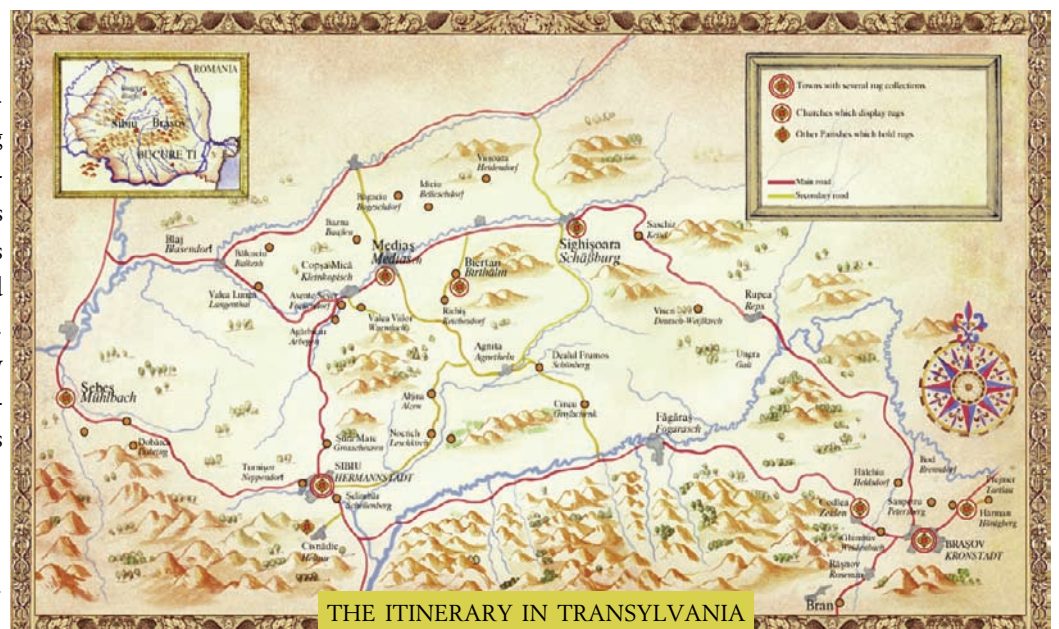
THE ITINERARY IN TRANSYLVANIA