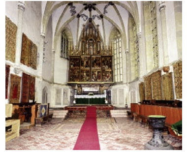
St. Margaret Church in Mediaş