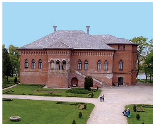
The Mogoşoia Palace