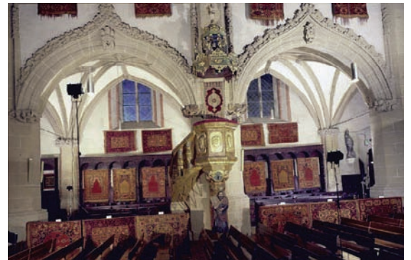
Ottoman prayer rugs in the Black Church