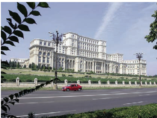
The House of the Parliament, Bucharest