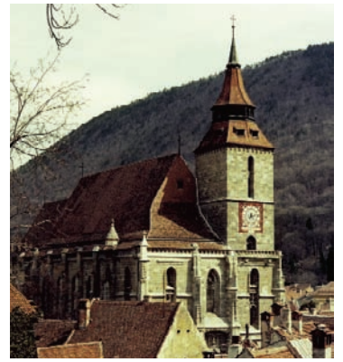
The Black Church in Braşov