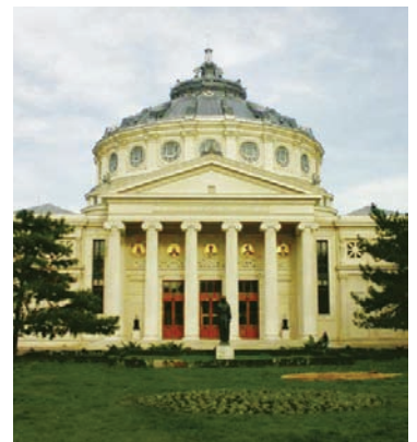
The Romanian Atheneum