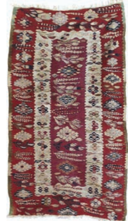
An Oltenian kilim ( scoartza ) MRP, Bucharest