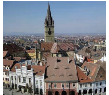
The great Lutheran Church in Sibiu