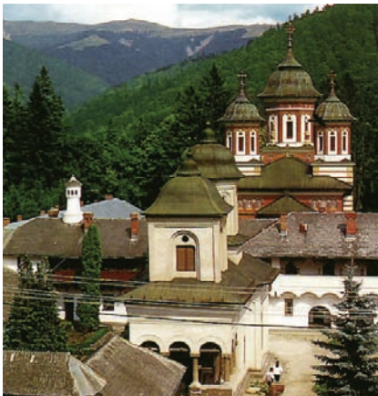
The Orthodox Monastery in Sinaia