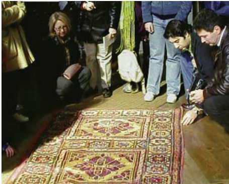
Study of a Ghirlandaio rug